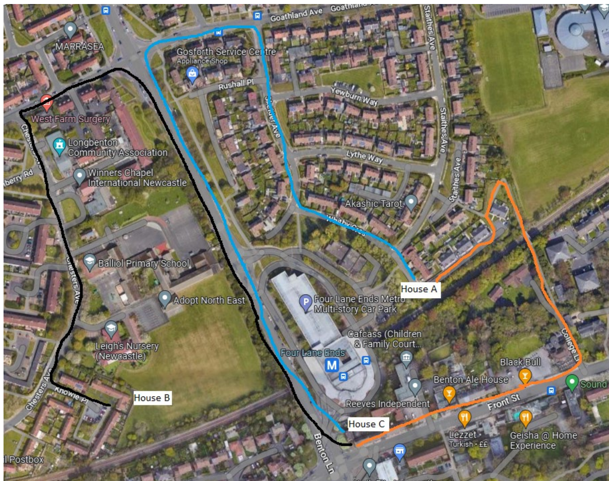
Image 2 – Shortest travel route between the houses closest to each other in Longbenton and Benton wards.

The LGBC proposal keeps the number of electors in both Longbenton and the Benton and Forest Hall wards the same. At present there are approximately 7,700 electors in Benton and 8,800 in Longbenton. The council's proposal adds over 2000 electors to the Longbenton