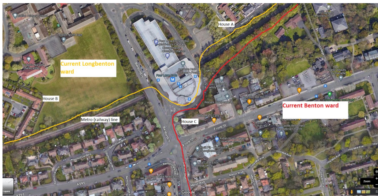
Image 1 – existing boundaries that the LGBC proposes to remain the same

The LGBCs proposal is to keep these boundaries as they are. They work well because the existing metro line forms a natural boundary, as does the Four Lane Ends transport interchange, and also the busy multi-lane road junction at Benton Lane/Front Street/ Benton Road A191 that is a main north-south/east-west traffic artery.