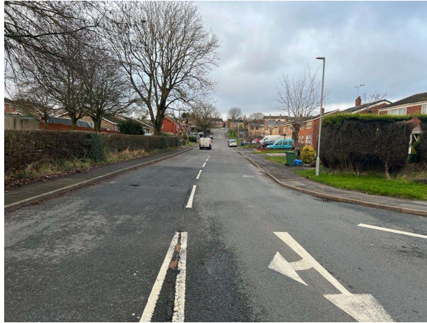
Image of Common Lane, taken from the junction of Common Lane to the Old Hednesford Road.

We shall also propose a name change for the proposed Cannock North Ward to Chadsmoor.