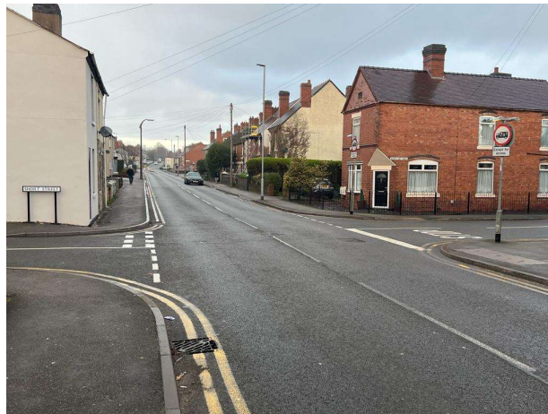
Image of the Cannock Road, approaching central corner roundabout, with Short Street on the left hand side and Heath Gap Road on the right hand side.

Heath Gap Road and Common lane also provide more of a distinct boundary between the two wards, and this proposed boundary ensures that the Chadsmoor community is not divided.