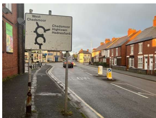
Image of the junction of Cannock Road coming up to central corner roundabout.

In conjunction with our original proposal, in order to ensure that this community is not divided and rather is kept together, we therefore propose that Cannock Road, from central corner roundabout, to Heath Gap Road and Common Lane to be the border between Cannock North and Cannock West, therefore moving Sankey Road, Hardie Green and Smillie Place into the Cannock North ward. The drawing of this border is outlined in the map attached in our original proposal.