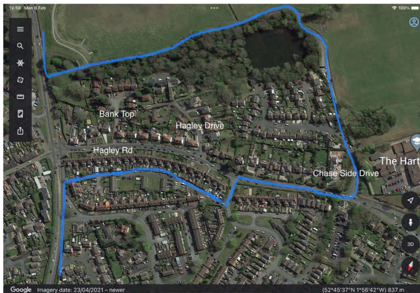
Image demonstrating the highlighted area in which we feel should be moved into the Western Springs ward alongside the commissions current proposed boundaries for Western Springs.

As demonstrated, key amenities to residents on Hagley Road, Hagley Drive, Bank Top and Chase Side Drive including Overpool Close and Pool Meadow Close are located within the proposed Western Springs ward.