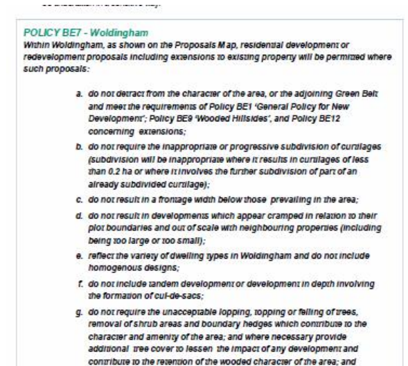
Figure 2: Woldingham-specific planning policy in the 2001 Tandridge District Council Local Plan