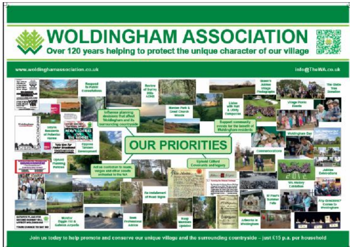
Figure 1: Woldingham Association Poster