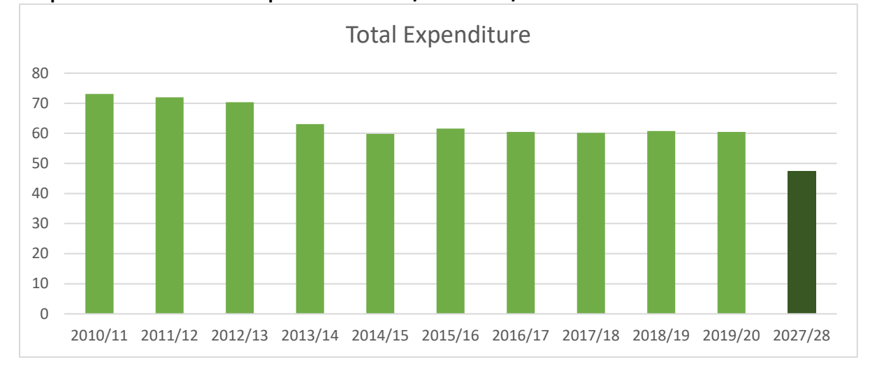
Graph 1: Decrease in Total Expenditure – 2010/11 to 2027/28: